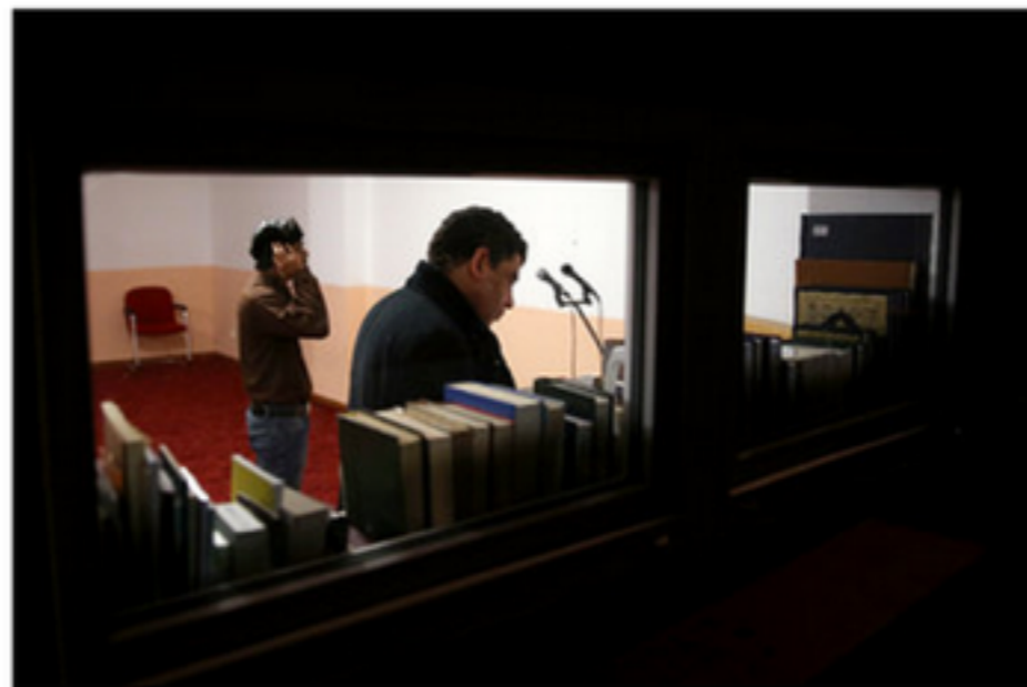
Muslims gathered for prayers Monday at a mosque in Dresden, Germany.