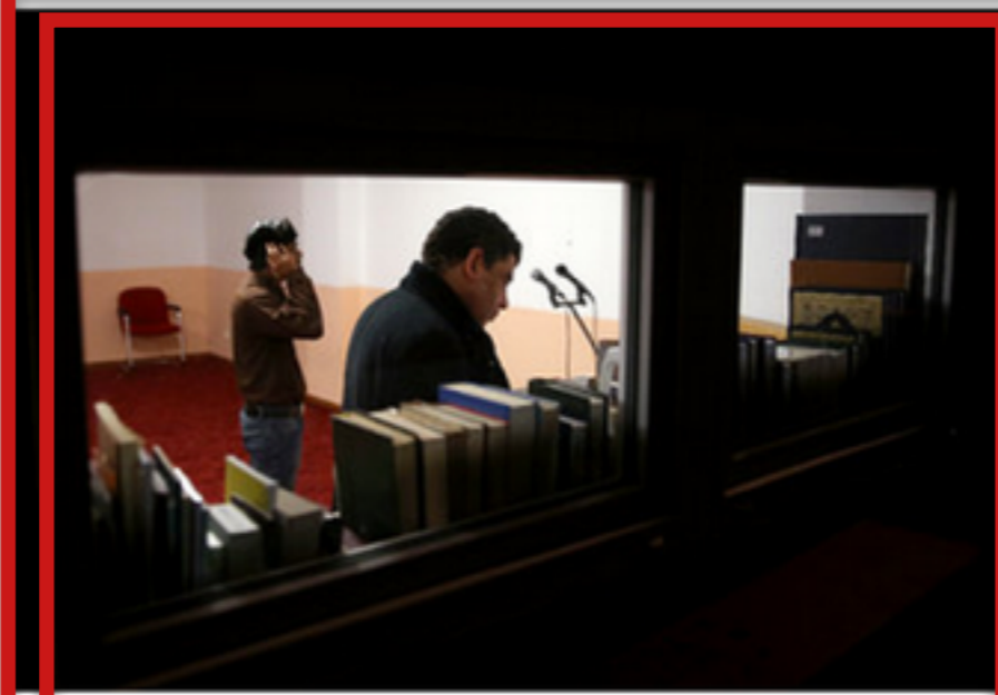
Muslims gathered for prayers Monday at a mosque in Dresden, Germany.