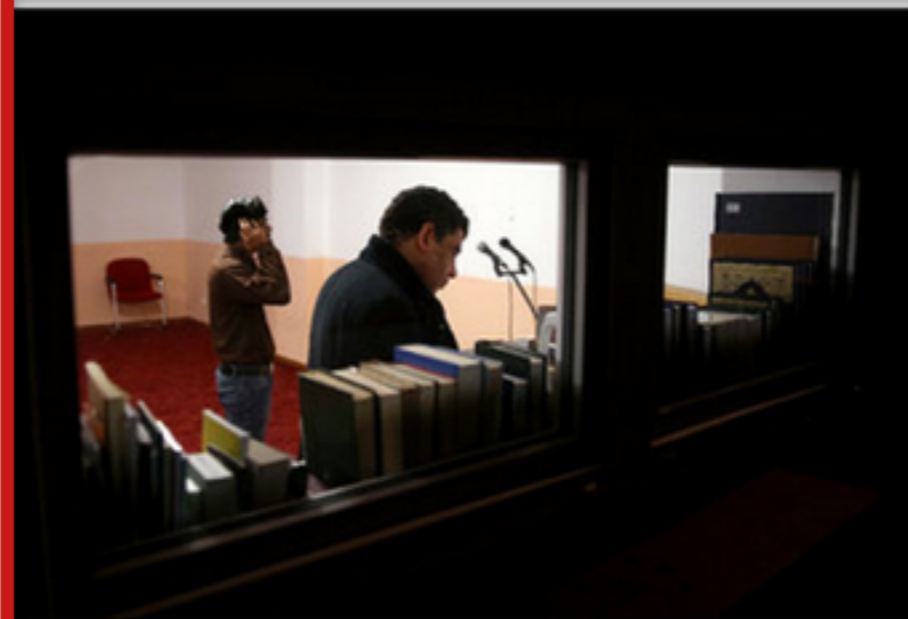
Muslims gathered for prayers Monday at a mosque in Dresden, Germany.